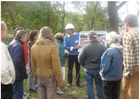
"Sunday in the Park" public event to present alternatives

Construction: $6M construction, currently in construction, 2013 completion estimated.