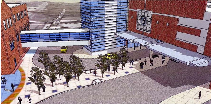
SketchUp view of the proposed plaza and pedestrian connections between the Center and the new garage

24. BRIEF DESCRIPTION OF PROJECT AND RELEVANCE TO THIS CONTRACT (Include scope, size, and cost)